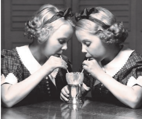
"Foods are more likely to be 'triggers'... when they are special,... or related to significant events."

As Saint Peter's celebrates its 150<sup>th</sup> anniversary, our dietitian indulges in a little whimsy and an update on her anniversary project.